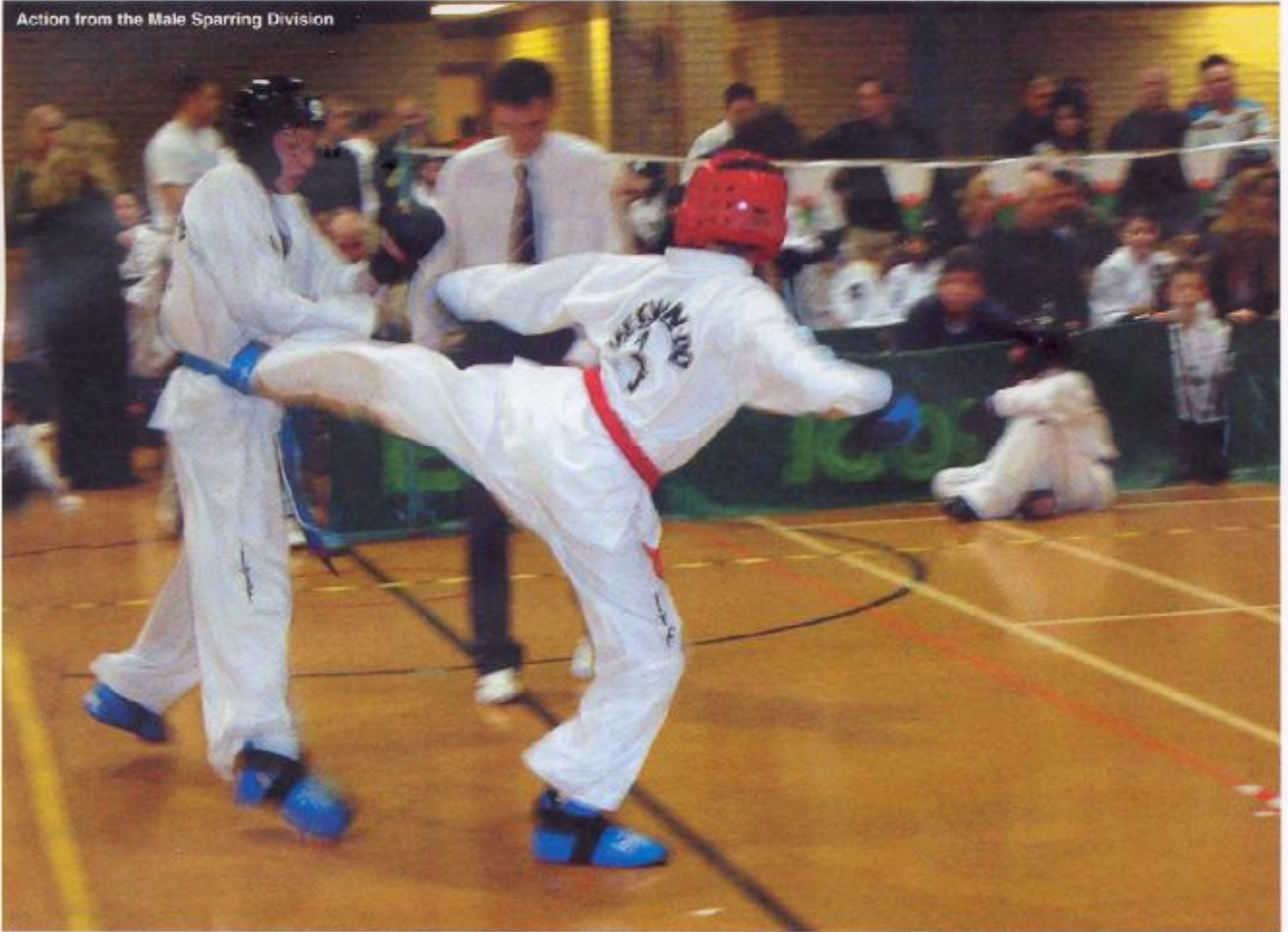
Action from the Male Sparring Division